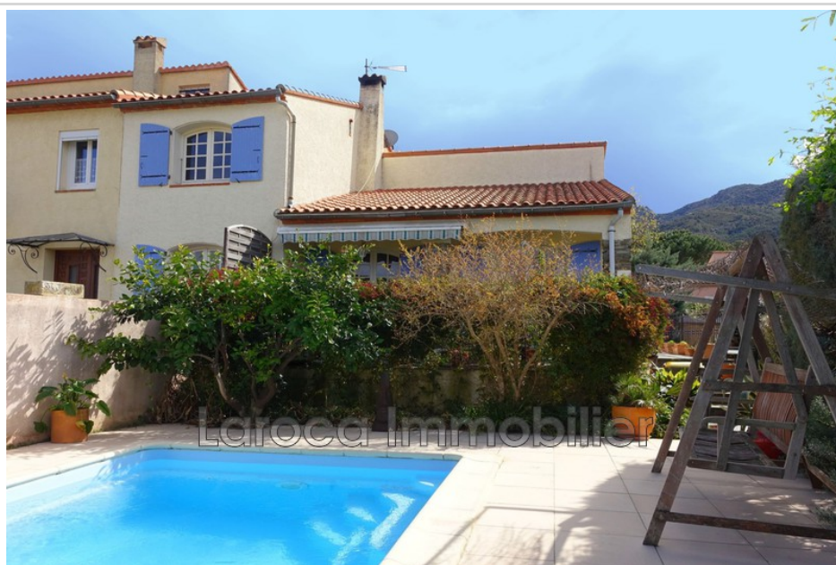
Villa 3609 Sorede

Property for sale in Sorede Ideally located, in a quiet cul de sac, just 800 meters from the shops, bars and restaurants of Sorede , this comfortable semi detached house is built on a very pleasant low maintenance 484 sqm land with swimming pool ! The ground floor of this house (accessible via 5 steps from the garden) has a 47 sqm bright living room with fireplace, two bedrooms, a great lime stone tiled bathroom with bathtub, walk in shower and WC. Upstairs, two further bedrooms with cupboards, a further lime stone tiled shower room, a separate WC and an attic room. The easy to maintain garden has a two sun catching terraces as well as a 7 x3 meter swimming pool. A 37 sqm garage and two good size storage rooms in the basement, complete the benefits of this very pleasant property with character ! Quietness, character, comfort and great location for this villa in Sorede ! Contact Laroca Immobilier , your Real Estate Agent in Laroque des Alberes .